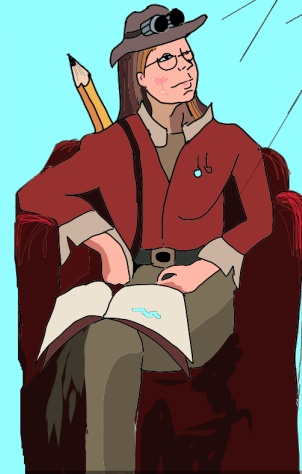
Illustration by Ardea Thurston-Shaine