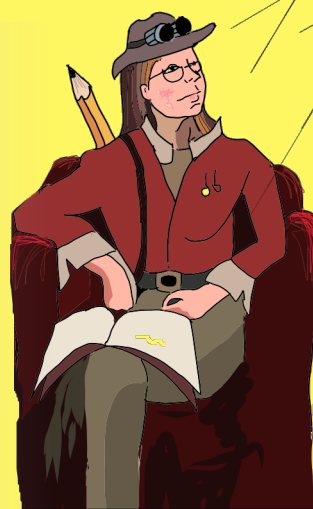
Illustration by Ardea Thurston-Shaine