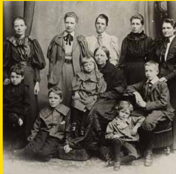
The Boole family after George's death

Handwritten mathematical notes, possibly related to Boolean algebra or set theory, including expressions like A \cup B , A \cap B , and A \setminus B .