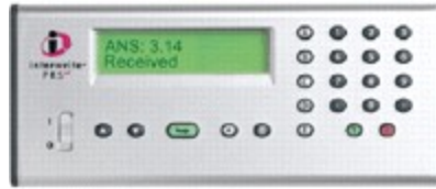
2 inches Interwrite PRS